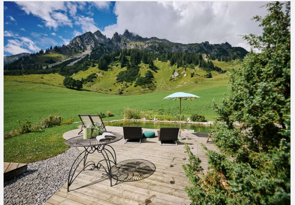
Exterior view garden and natural pond